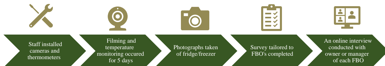
Figure 4. Fieldwork for FBOs

The fieldwork process and quality assurance protocols for FBOs were the same as households with the following exceptions.