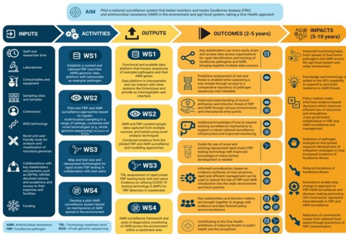
Figure 2 PATH-SAFE programme ToC

Additional outcomes focused on bringing together key stakeholders and decision makers to engage with key evidence, and contribution to 'One Health' goals and ambitions for public health have been added to signify the holistic change anticipated at the programme-level. The revised ToC is presented in Figure 2, and will be edited following the impact feasibility assessment (see Section 3.3). The activities and outputs are intended to be carried out and delivered by March 2024 when the current phase of funding completes. The outcomes and impacts are anticipated to be realised over the medium (2-5 years) to long-term (5-10 years).