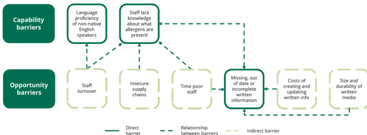
Figure 5: Mapping of COM-B barriers to ensuring the accuracy of allergen information

Figure 5 provides a visual mapping of the barriers identified in this section. Mapping barriers in this way can help when thinking through interventions for improving cross-contact management. Interventions targeting direct barriers may be effective in helping businesses to overcome the immediate challenges they face. However, the impact of these interventions may be limited unless interventions are also developed that target the indirect barriers which contribute to direct barriers in the first place.