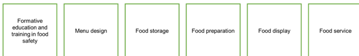
Figure 3: Cross-contact risk management stages

This research made clear that cross-contact risk management occurs across multiple stages, from ensuring staff complete formative education and training in food safety, all the way through from menu design to food service. In total, six stages at which cross-contact risk management occurs were identified during the analysis ( footnote 1 ). These are summarised below and illustrated by Figure 2. Table 4 at the end of the section also summarises all the behaviours and approaches identified at each stage.