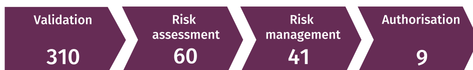
Figure 17: Total live applications 2021/22: 420

The approval process for regulated product applications broadly comprises four stages. Figure 17 details at which stage the live applications were being held.