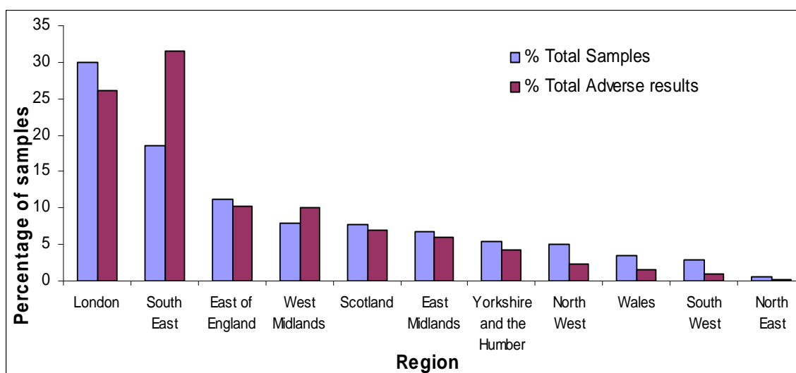
Chart 3: Percentage of Samples and Failures by region