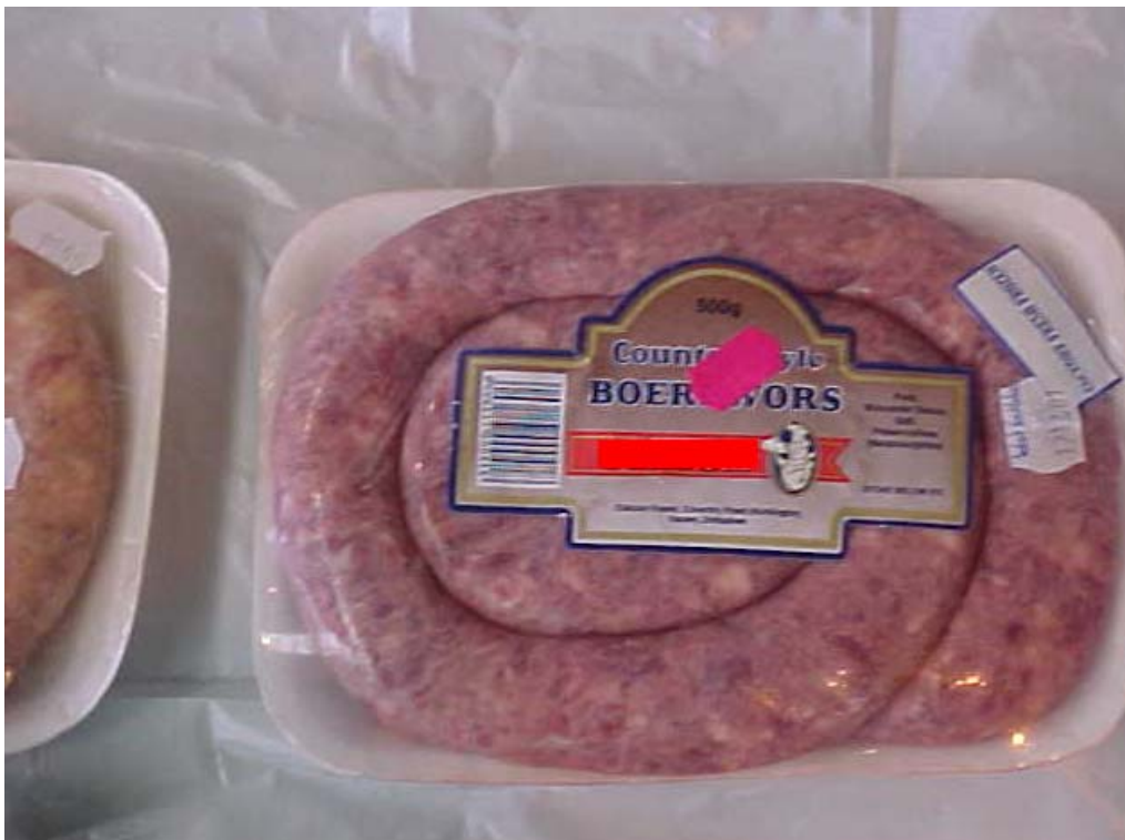
"Factory fresh frozen" "Boerewors sausages – Product of RSA"