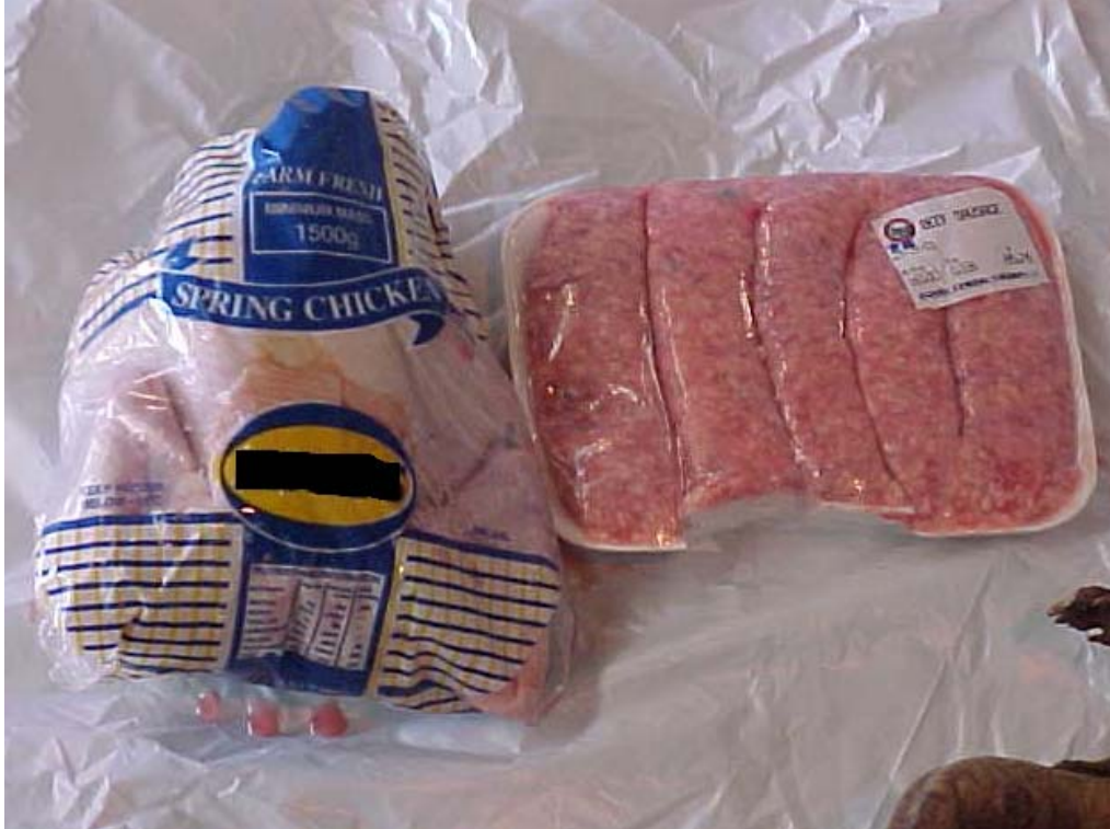
Chicken and beef sausages labelled "Product of RSA"

The following products are discovered during the routine inspection of a cut-price retail butcher's shop: