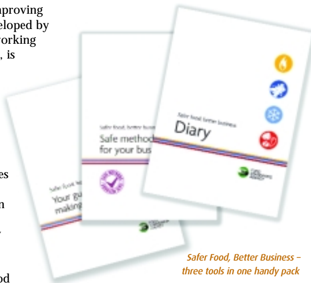
Safer Food, Better Business – three tools in one handy pack