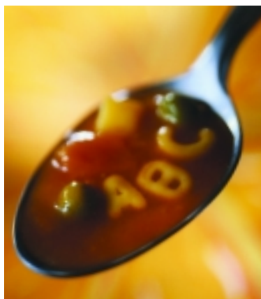
Ensuring schoolchildren receive adequate nutrition is not always as simple as ABC

The Agency Board will be discussing policy options early next year. A series of academic and public events is also planned