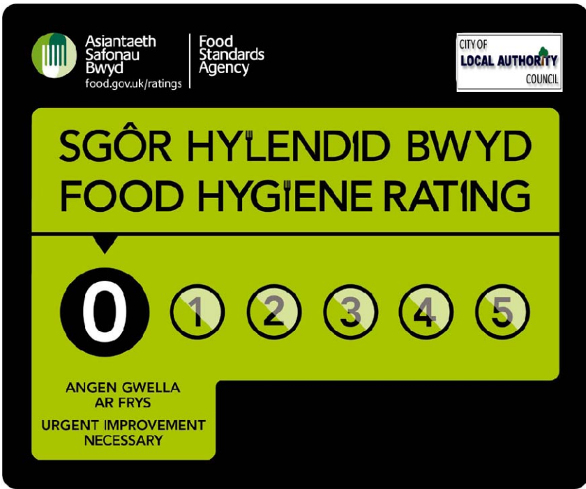
Sticker (back) - 'Awaiting Inspection'