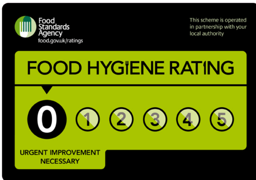
Stickers (front) – option 2 – space for local authority logo