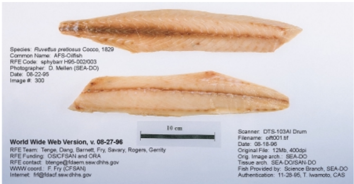
"Regulatory Fish Encyclopedia: http://www.cfsan.fda.gov/~frf/rfe0.html Office of Seafood and Office of Regulatory Affairs, U.S. Food and Drug Administration, 1993-2003."